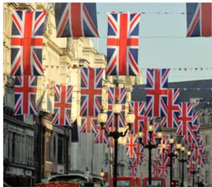
Bea's of Bloomsbury >